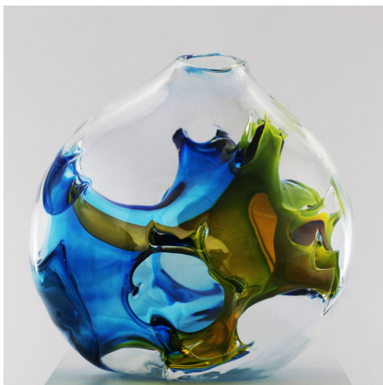
Stijn Wuyts, « Inner space », 2020